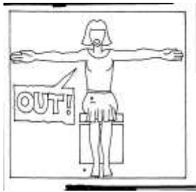
SHUTTLE IS OUT