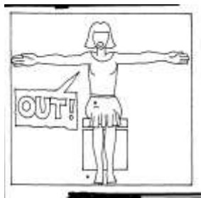
SHUTTLE IS OUT