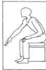
SHUTTLE IS IN