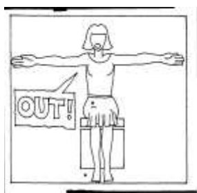
SHUTTLE IS OUT