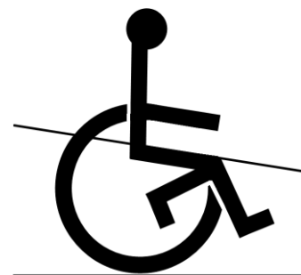
Forwards = not allowed