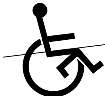
Backwards = correct