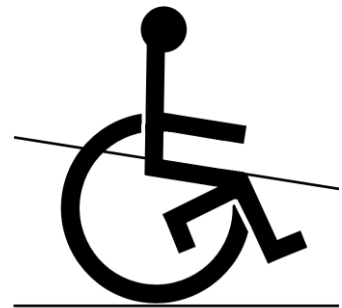
Forwards = not allowed